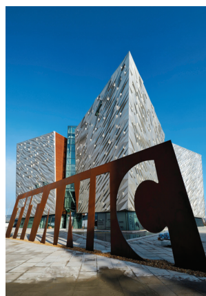
Titanic Museum, optional extension

Day 11: Kilkenny Today is devoted to Kilkenny, a well-preserved medieval city known as Ireland’s cultural capital – and the country’s smallest city. We tour 12 th -century Kilkenny Castle, considered one of the country’s most beautiful, then embark on an informal walking