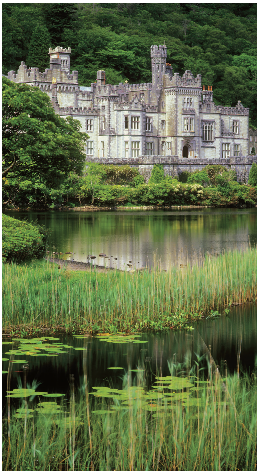
We tour Kylemore Abbey, home to Benedictine nuns.