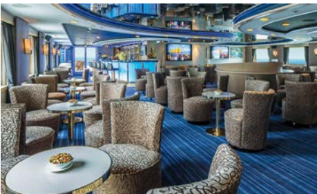
The lounge is the perfect place to relax.

Outdoor café, lounge with bar, restaurant, sundeck, reception desk, observation lounge and library, laundry, Global Gallery, marina platform. Open Bridge allows guests to meet the captain and officers and learn about navigation.