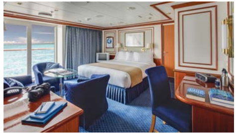
Category 6 cabin.

All cabins and suites feature ocean views, private facilities, climate controls, and a flat-screen TV. Equipped with Ethernet and Wi-Fi connections and USB ports for mobile devices. Some cabins have French balconies. Botanically inspired shampoo, conditioner,