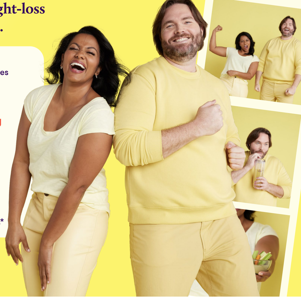
Get started today at wondrhealth.com/brynmawr

and be your healthiest self— while eating the foods you love. Our program is based on behavioral science and takes a personalized approach that fits into your life—at no cost to you.*